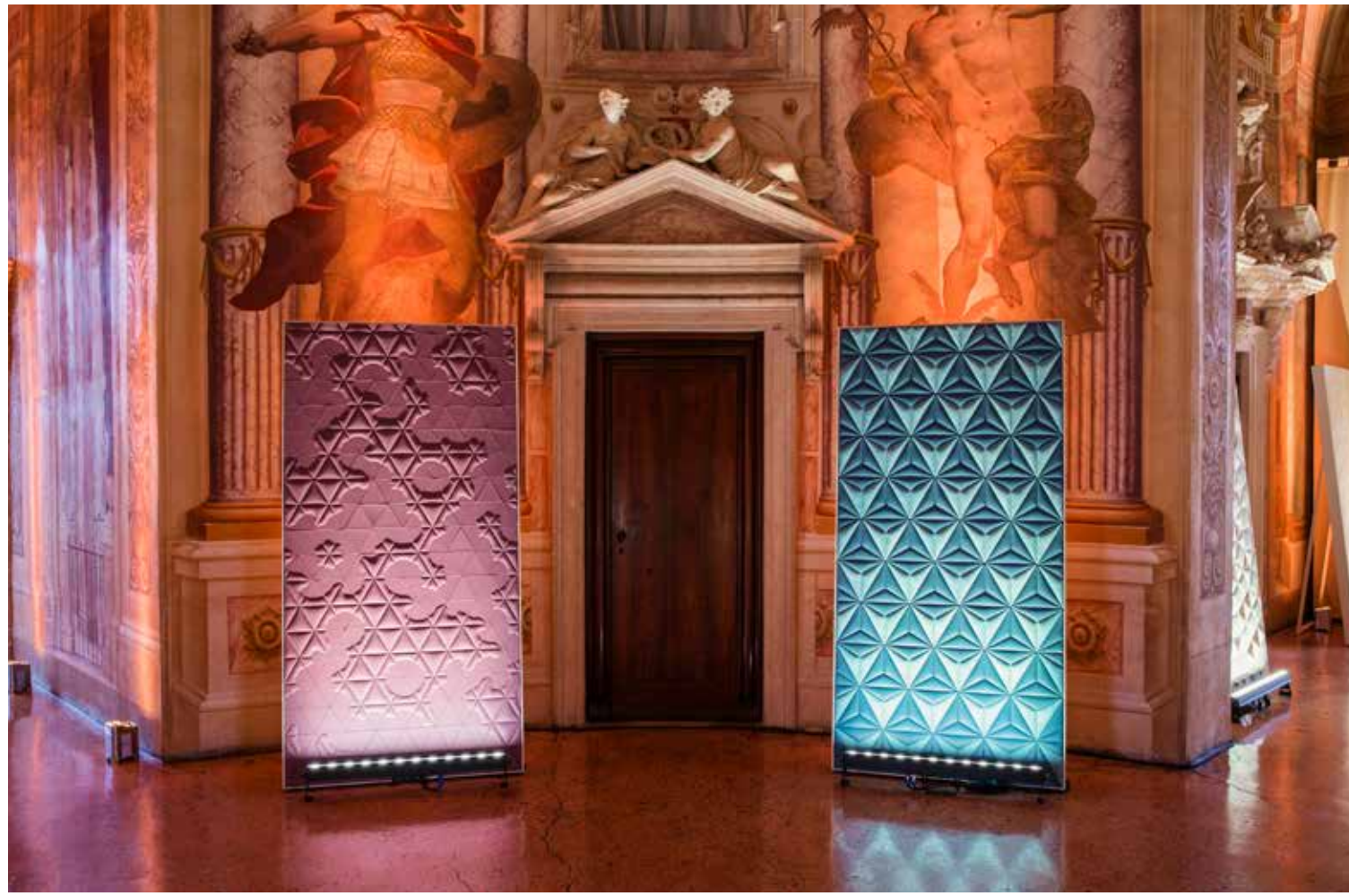
Above: The leather wall coverings Ng designed for Italian luxury brand Studioart are based on mathematical formulae.

develop traditional hand weaving and batik in Guizhou.