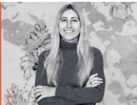
Sir Paul Smith for Maharam